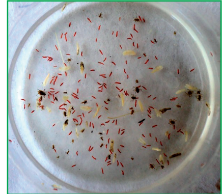
Fig. 3 Thrips larvae after distillation from the electors

heated with a 40 W electric lamp for 7 hours. Under the influence of high temperature, thrips larvae leave the ear and move downward away from excessive heat, and when they hit the hot internal surfaces of the selector, they fall through the funnel into a glass with a 48% alcohol solution. Subsequently, the contents of the beaker with the alcoholized thrips larvae are poured onto a filter paper of 10 × 10 cm, where they remain, which allows them to be counted (Fig. 3).