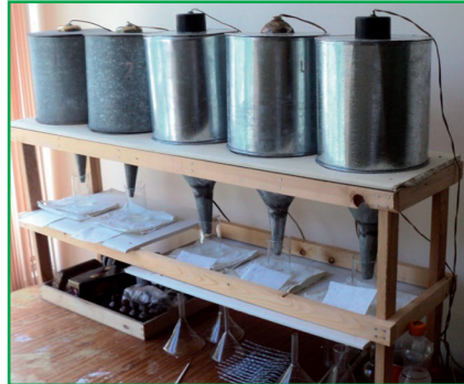
Fig. 2. The use of electors for wheat thrips distilling