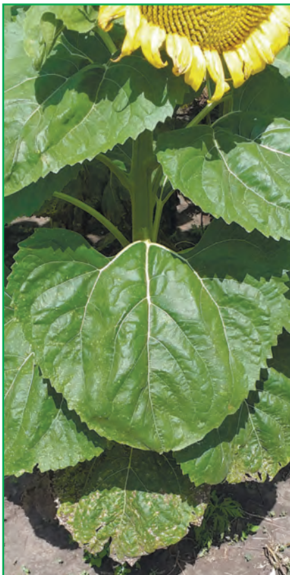
Photo 4. Lesions of the leaves of adult sunflower plants (fruit formation phase)