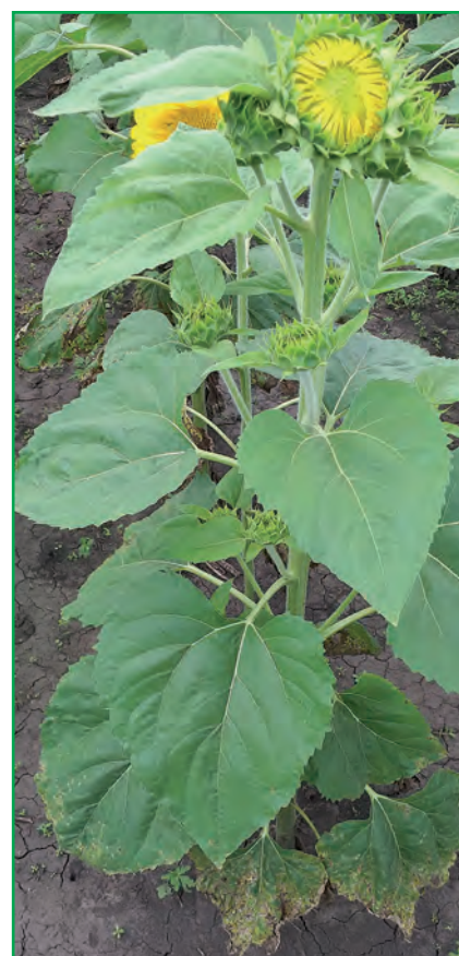
Photo 3. Lesions at the phase of the beginning sunflower flowering

Notes: 1. ** — differences from hybrid ZL58 × HAR7 are significant at the 0.01 level of significance in 2020; 2.*** — differences from hybrid ZL58 × HAR7 are significant at the 0.001 level of significance in 2019.