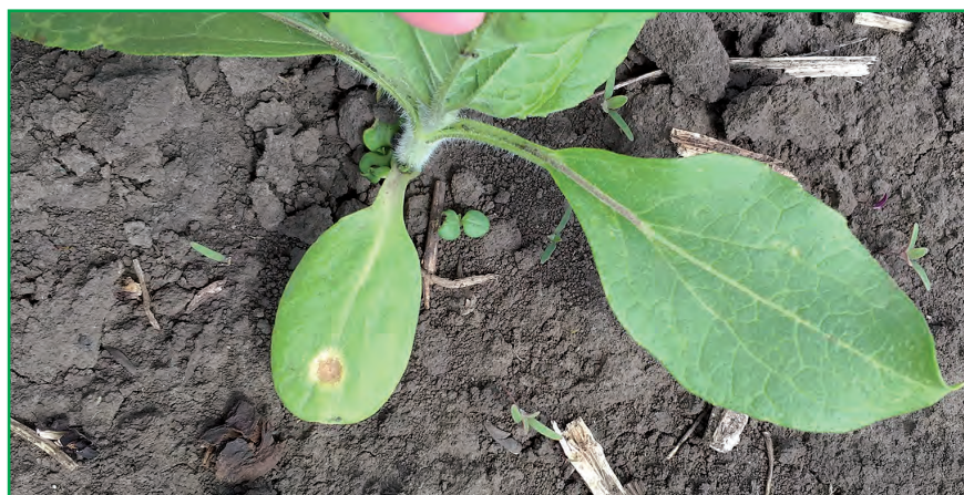
Photo1: Septoria leaf spot on cotyledon leaves of sunflower

The characteristic symptoms of pathogen damage are the appearance on the lower leaves of small, from brown to dark brown, irregularly shaped spots, gradually spreading to the upper tiers of the plant. In under wet conditions, in the center of the spots small pycnidia with pycnosporae are formed. Then the spots merge and the leaves wither. The pathogen S. helianthi mainly infects sunflower leaves, but can damage stems and heads [3].