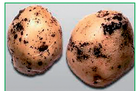
Fig. 1. External signs of damage to potato tubers by the fungus Rhizoctonia solani Kuhn (Prolisok variety)

The analysis of the latest studies and publications. The latest official publications with the description of potato cultivars contain some information as to their resistance to many diseases, in particular to potato tuber eelworm, potato blight, brown scab, Irish blight, but there is no information as to black scab. The main publications as to potato black scab do not contain the information as to the resistance of most potato cultivars against this disease. The information as to potato resistance against potato blight can not be used for black scab,